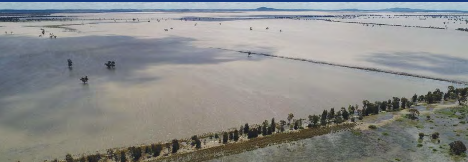
Aerial view of flooding at Marsden showing the Newell Highway in the foreground, 27 October 2022

The Australian Government and the NSW Government have committed to flood mitigation works on the Newell Highway between West Wyalong and Forbes.