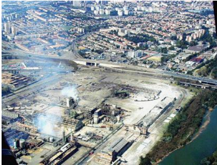
Toulouse Explosion Crater