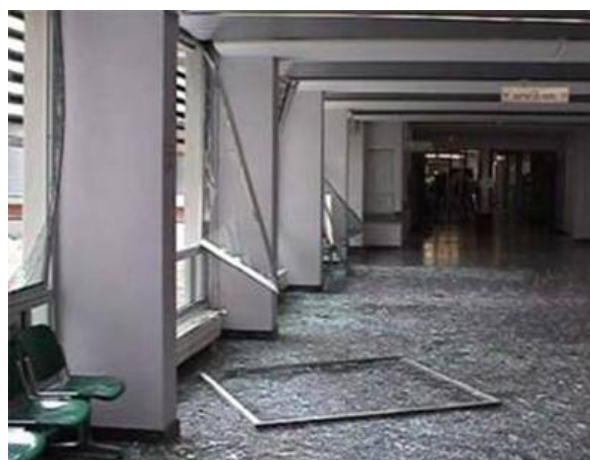
Building Damage Toulouse