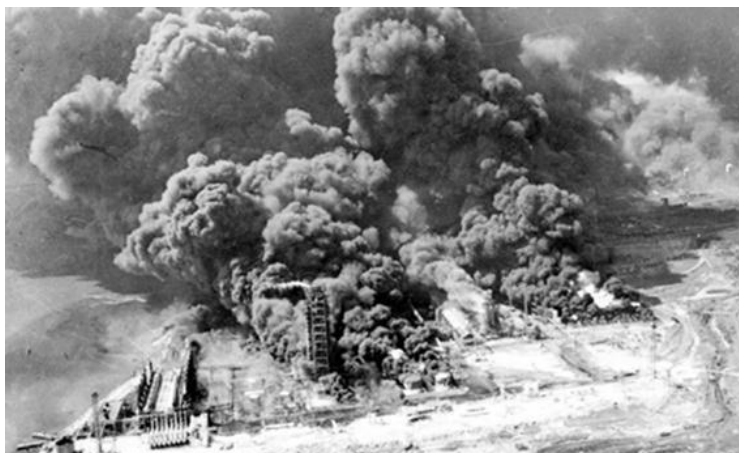
Accidents with Ammonium Nitrate