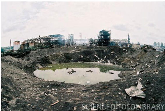
Toulouse Site Damage