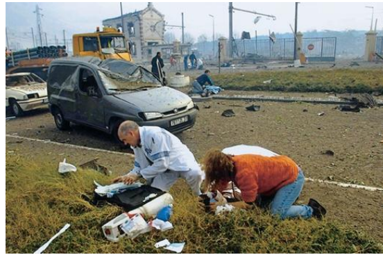
Toulouse Explosion Injuries